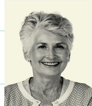
SENIORS' HOUSING DATABASE